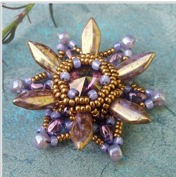
This is how the finished star looks like