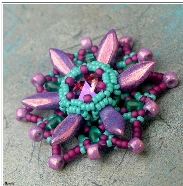
And here I added one more row of netting