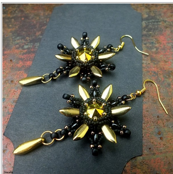
These stars can be used as earrings or pendants.

I used the same kind of embellishment on the gold/black earrings on the left.